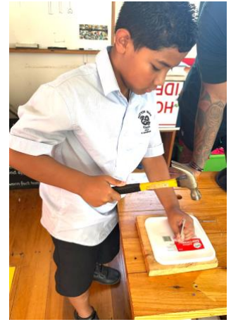
Room 8 students making their own worm farms from old plastic containers.