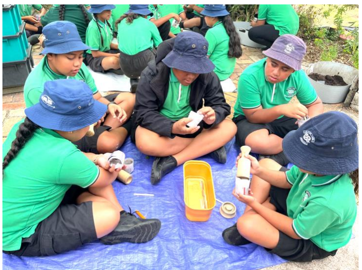
Above: R7 making seed planters from old newspapers at Zero waste.

If your child has outgrown their uniform, please consider donating it to us, so we can pass on to families who need it.