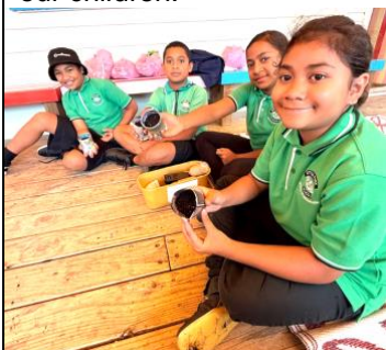
Far Right: R9a at Zero-Waste