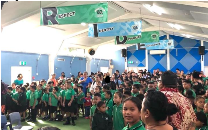
Above: The powhiri and first assembly of 2025.