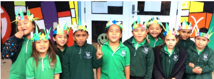
Above: R13A looking colourful in their paper headbands made to celebrate Cook Island Language Week.

Meitaki maata to Mr Katafono and some of our school leaders in opening our Week 3 Values Assembly in the Cook Island Language. This week, the students will have lots of activities to do to celebrate Cook Island Language Week and they have been laid a challenge from our school leaders to learn different phrases in the language.