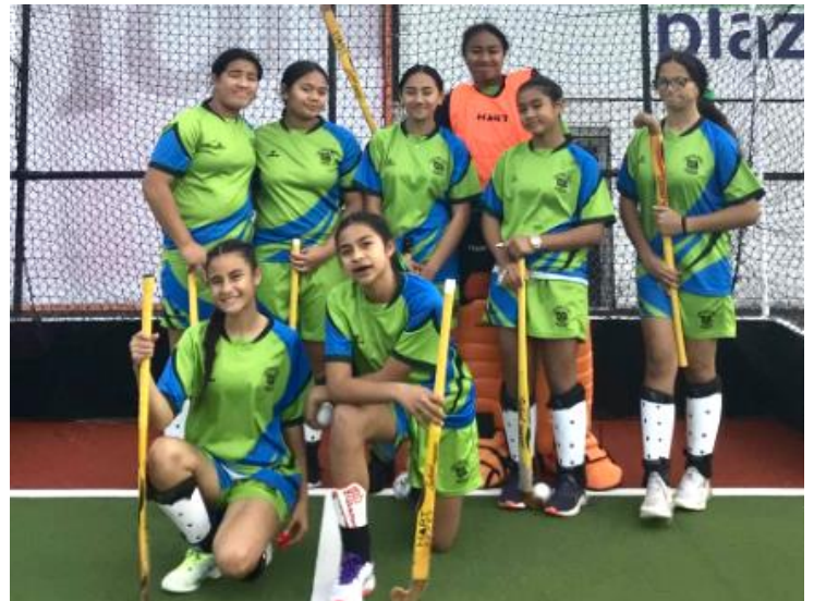
Above: The Y7&8 girls’ team at the Kolmar Events Centre Hockey turf.

Congratulations to both our boys and girls teams who competed in the Year 7-8 Hockey tournament last week. Thank you to both teams who represented our school with pride. Some great results, where our Year 7-8 girls placed 3rd overall! Well done girls! Looking forward to more sports teams going out over the next couple of weeks. Huge thank you also to their respective coaches for taking their time to coach the teams.