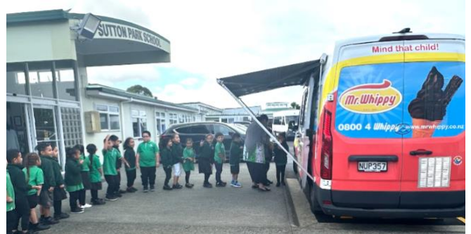
Above: R4 lining up for their Mr Whippy treat a couple of weeks ago.

Whenua R5 85% and R13A 93% Moana R6 87% and R17 82% Aorangi R7 95% and R11A 90% Atea R8 98% and R10 86%