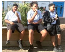
Centre: Sami R4